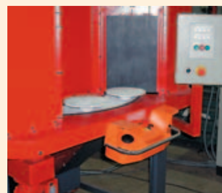
Table with two satellites outside

Because of the modular system, table sizes can be fitted with six, eight, ten or twelve satellites. The work-piece mountings or the work-pieces themselves are clamped on these.