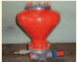
Pressure blasting equipments