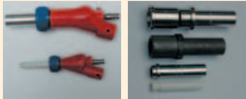
Blasting guns with different outputs