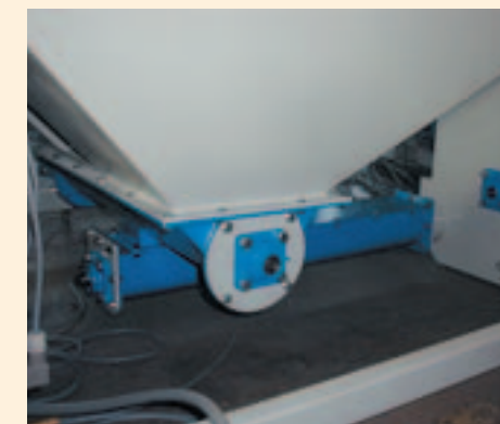
Blasting media screw and elevator

If necessary, the standard version of the machine can be fitted with a sieve to separate the arising burrs or foreign bodies.