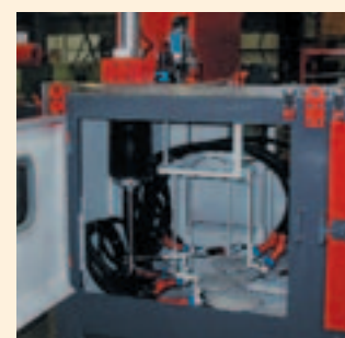
Nozzle moving device

On the back wall of the machine there is an updraft separator that catches residual blasting media, dust and light foreign bodies. After blasting, the parts are blown off by special nozzles in a chamber that is separate from the blasting chamber to remove any residual blasting media.