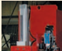
Devices for vertical and horizontal nozzle movements