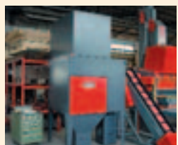
Dust collector for all materials