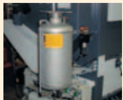
Complete antistatic device for thermoset deflashing