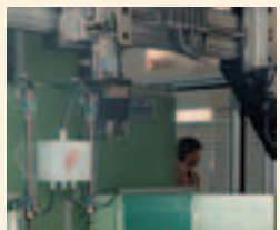
Handling devices for automatic loading and unloading