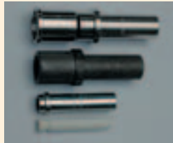
Steel, ceramic or boron carbide nozzles