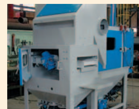
Processing system for blasting media.

A special blasting media processing system was developed for the SA series and this is fitted with a cascade separator for the undersized particles of blasting media and for dust particles and with a vibro-sieve for foreign bodies. The bottom part of the blasting media processing system is designed as a hopper with generous dimensions so that several blasting guns or several pressure blasting systems can be connected.