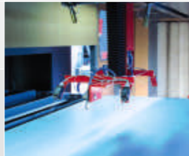
Inside-View Painting Cabinet