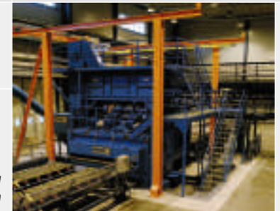
Roller-Conveyor Blast Cleaning Machine 3.60 m tunnel width