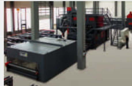
Complete Preservation Line